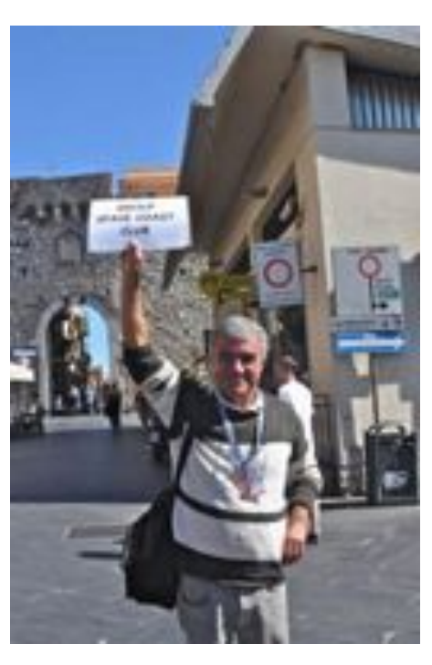
Excellent guide in Messina

Last month, I wrote about highlights from the Cruise that included 42 Space Coast members. In addition, around every corner, everyone had their own experiences that made the trip phenomenal and unexpected. Whether it was a surprise scene, cafe, or chat with a local, we all had moments that made you want to stand still and take it in.